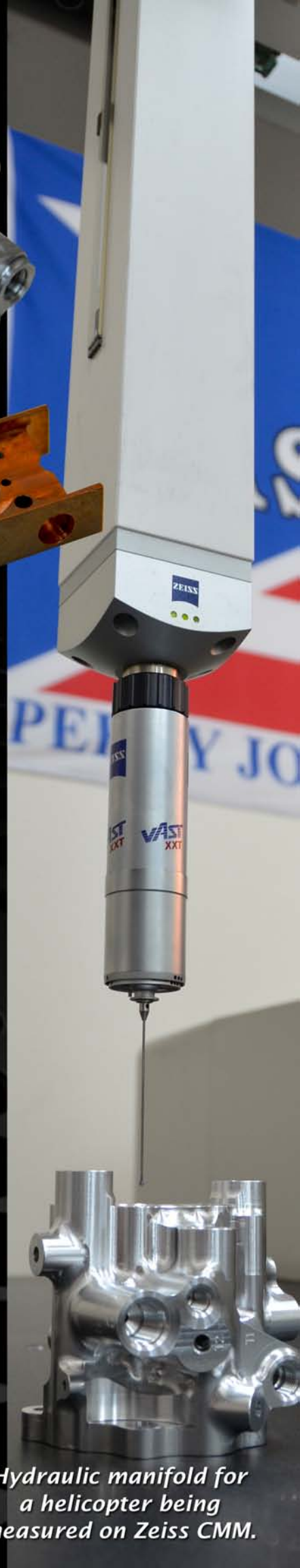
Hydraulic manifold for a helicopter being measured on Zeiss CMM.